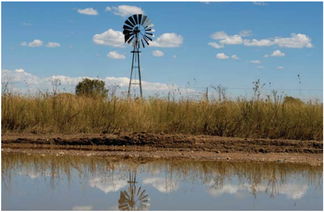
Water pumps are a common sight in the often flat and dry landscape

government would be allowing fracking to take place immediately. It is unlikely that the effects of fracking would ever be reversed once it has started taking place.